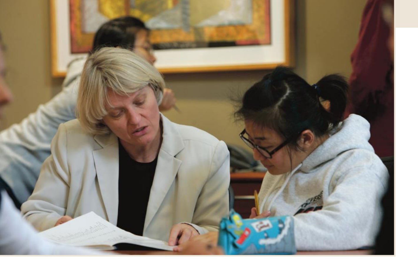
Goal 2: Illinois State University will demonstrate excellence in scholarship, teaching, and learning at the undergraduate and graduate levels.

Illinois State supports a diverse and accomplished faculty and staff committed to excellence in teaching and learning at the graduate and undergraduate levels. The University is committed to engaging faculty and students in a variety of experiences that will enhance teaching, research, and scholarship and elevate Illinois State's reputation at the state, national, and international levels. Students are provided with opportunities to participate in research and creative endeavors that encourage them to view learning as a lifelong process. Faculty generate new knowledge through nationally and internationally recognized original contributions to their disciplines. The University must address the barriers faculty face as they seek external funding, work to publish in their disciplines, and continue to serve the University and its students.